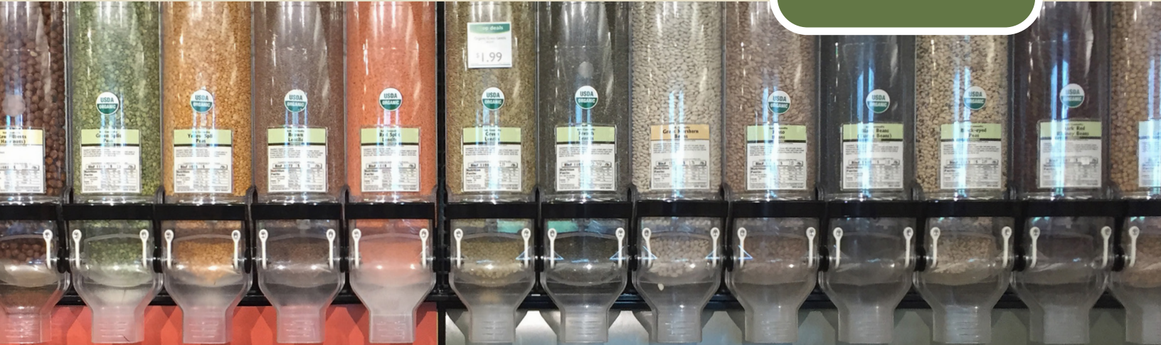
del producto en el amarre